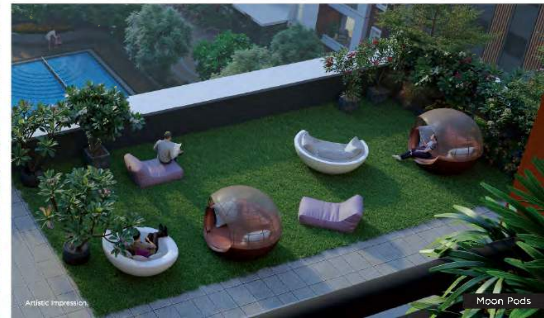
Sky Gazing Deck

Images used are for representation purpose only.