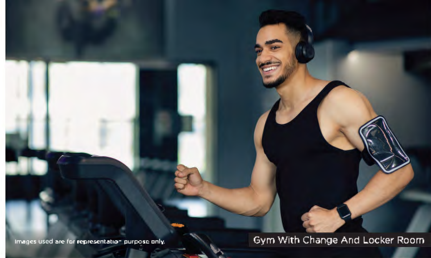
Gym With Change And Locker Room

Images used are for representation purpose only.