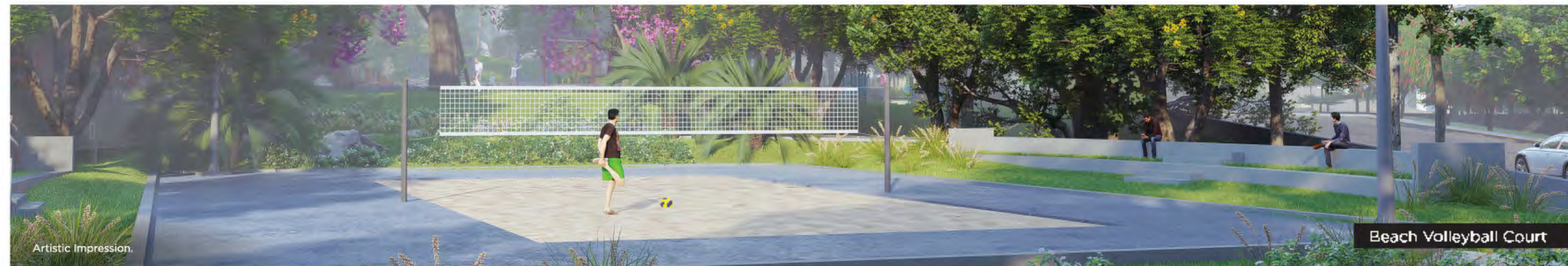
Beach Volleyball Court